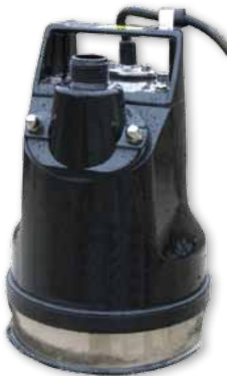
AL45 Puddle Sucker